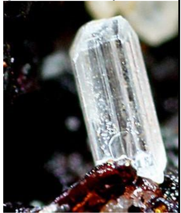
Cerussite - PbCO_3 Graphic Mine