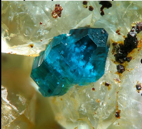
Spangolite Serpierite Blanchard Mine Graphic Mine